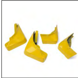
Splash Guards - Front and Rear

This cargo mat provides an exact fit for your trunk floor and helps protect the trunk carpet of your vehicle. This mat features the Camaro logo.