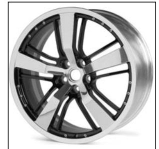
21 inch Wheel / Tires Pkg VZN- $4680.00

Personalize your Camaro with these attractive 21-inch split-five-spoke painted black Accessory Wheel, validated to GM specifications.