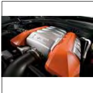
Engine Cover- V8 VYX- $285.00

These premium carpet floor mats will add a custom appearance while helping to protect the carpet of your new Camaro from mud, water, road salt or dirt.