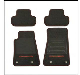
Floor Mats - Front and Rear Carpet

The ground effects package creates a dramatic, ground hugging look for your Camaro. It includes a front splitter, side rockers, and a rear diffuser with chrome exhaust bezels. Not compatible with Quarter Flares/Splash Guards.