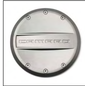
Fuel Door VQL- $175.00

$360.00 VRB-Red w/ Black Stripes VRU-Gray w/ Black Stripes