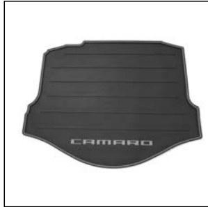
Floor Mat - Cargo Area VLI- $135.00

This cargo mat provides an exact fit for your trunk floor and helps protect the trunk carpet of your vehicle. This mat features the Camaro logo.