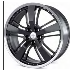
21 inch Wheel / Tires Pkg VZP- $4865.00

Secure items in the trunk area of your vehicle with this utility Cargo Net.