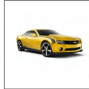
Ground Effects VTD- 2265.00

Personalize the exterior of your vehicle with this attractive Satin Nickel Fuel Door. It features the Camaro logo.