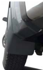
Splash Guards - Molded

This black Wheel House Liner protects the rear wheel house of your truck from damage caused by rocks, dirt, salt, road debris, and weather elements. It also enhances your truck's appearance by providing a more finished look. Not for use on Dually models.