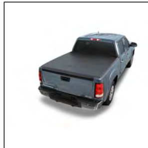
Tonneau Cover - Soft VPB- $477.00

Folding High Gloss Tonneau Cover Available in Black.