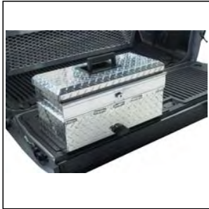
Tool Box - Side Storage VPF- $258.00

Add security and organization to your Sierra with this diamond-patterned, powder-coated aluminum Side Storage Box. Secure it at any position along the rails of the Cargo Management System. With an integrated handle, it is easy to remove and carry.