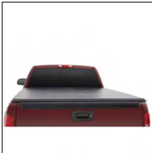
Folding High Gloss Tonneau Cover Black

Help protect the bed of your rugged Sierra with either a durable Carpeted Bed Rug, both come complete with tailgate liner. Both are available for all bed lengths with designs that fit with or without Cargo Management System Rails.