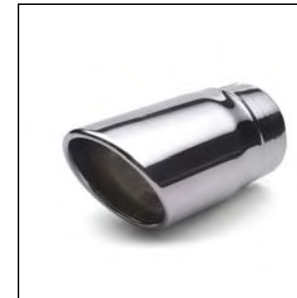
Exhaust Tips - OE or Cat-Back