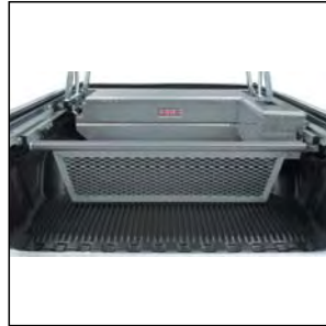
Bed Divider - Sliding VML- $325.00

Add security and organization to your Sierra with this diamond-patterned, powder-coated aluminum Side Storage Box. Secure it at any position along the rails of the Cargo Management System. With an integrated handle, it is easy to remove and carry.