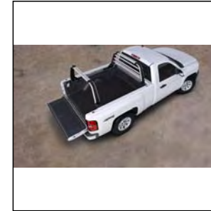
Overhead Bed Divider VMM- $595.00

Go for the ultimate in personalization with this custom chrome replacement grille.