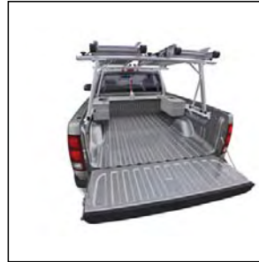
Cargo Management System VMK- $340.00

Organize the bed area of your Sierra with this sturdy, metal mesh Sliding Bed Divider. It slides on the Cargo Management System rails to help you organize cargo within the pickup bed.