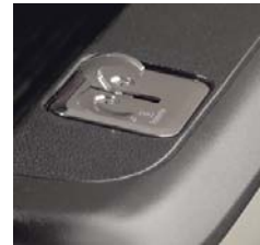
Tie Down Hooks - Bed Mounted

SIERRA HD "On The Job Package" PDC - MSRP: $495.00