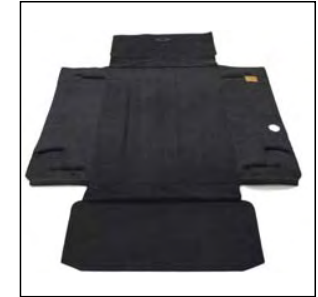
Bed Rug VBN- $454.00

Add cargo management versatility to your truck bed with these Overhead Bed Dividers or an Overhead Utility Rack. Overhead Bed Divider shown.