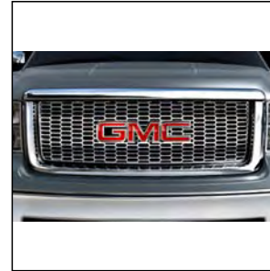
Grille- Chrome VAT- $422.00 (LD Only)

An innovative cargo management rail system featuring rails which run the length of the bed sides and behind the cab and incorporate upper and lower tracks and four sliding tie down brackets. Enables the use of an overhead utility rack, sliding diamond pat