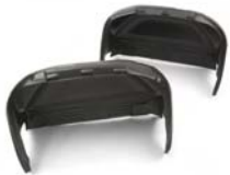
Wheel House Liner

SIERRA HD "Protection Package" VQG - MSRP: $384.00